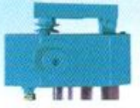
OIL BATH LIFTING ASSEMBLY