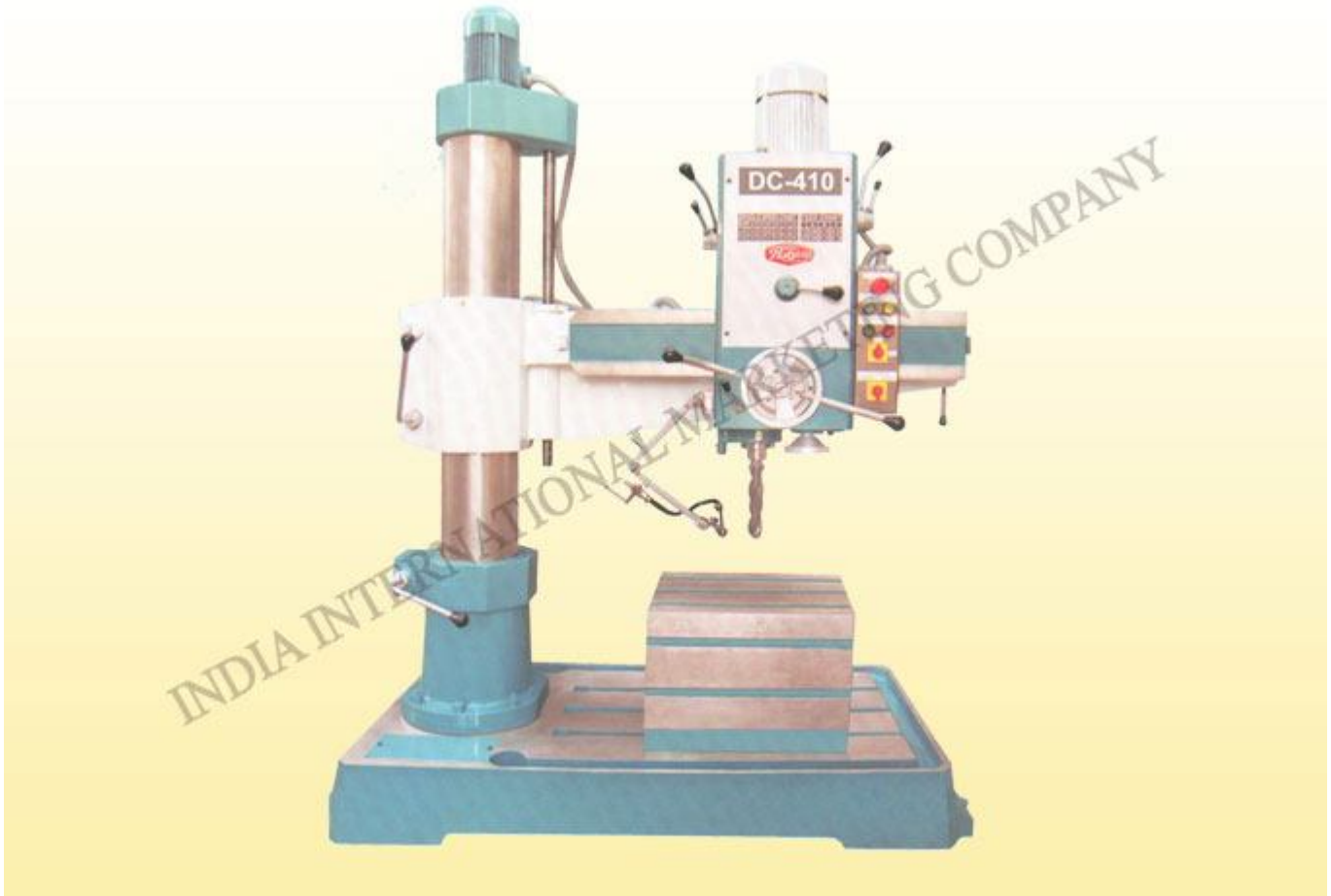
42 mm cap. Double Column All Geared Auto Feed Radial Drill Machine